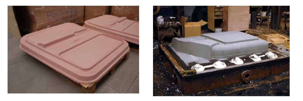
From these files, foam molds are produced using a computerised mill. In the image above you see the interior of the SASA-172 and in the image above you see one of the doors.